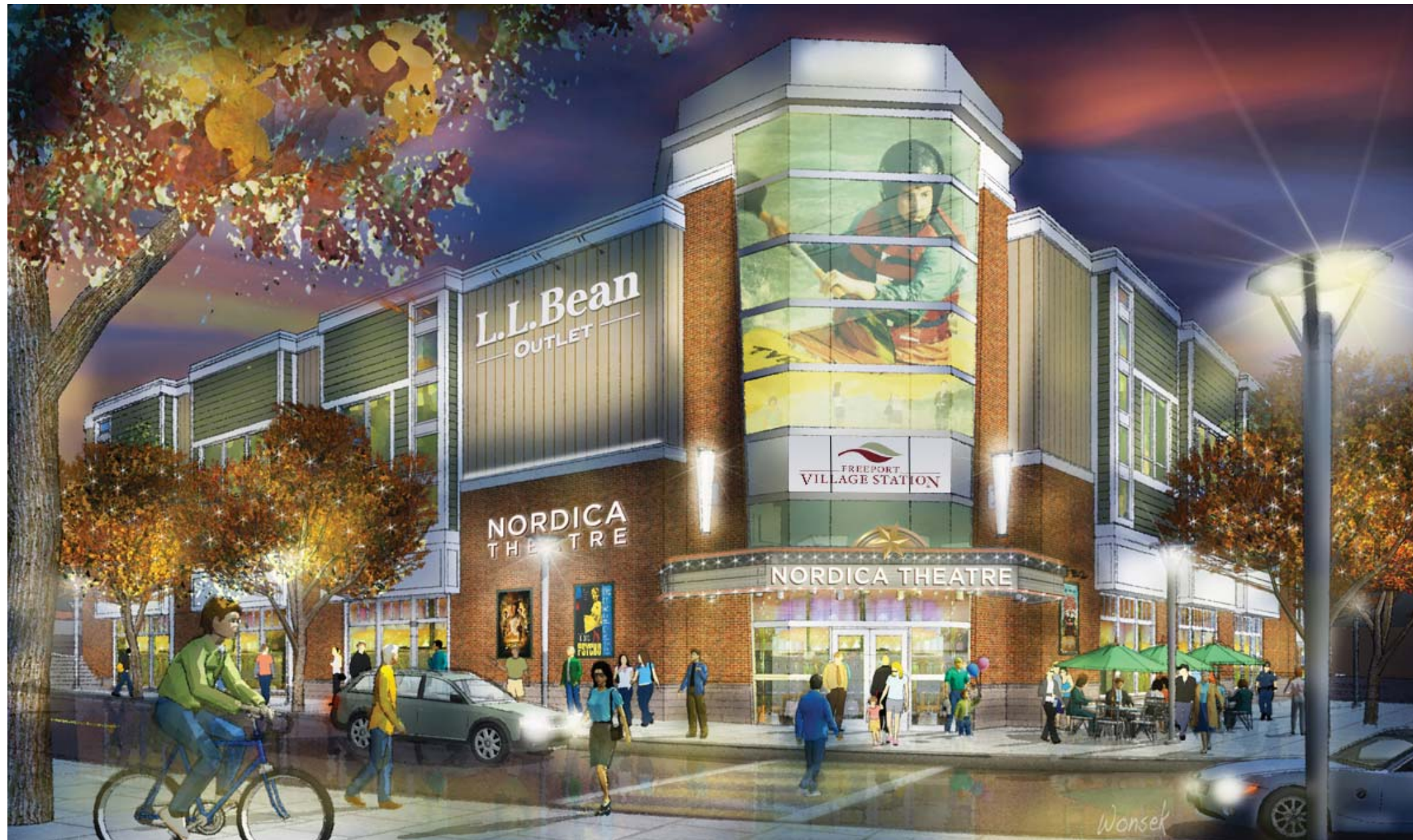
View from Mill Street and Depot Street