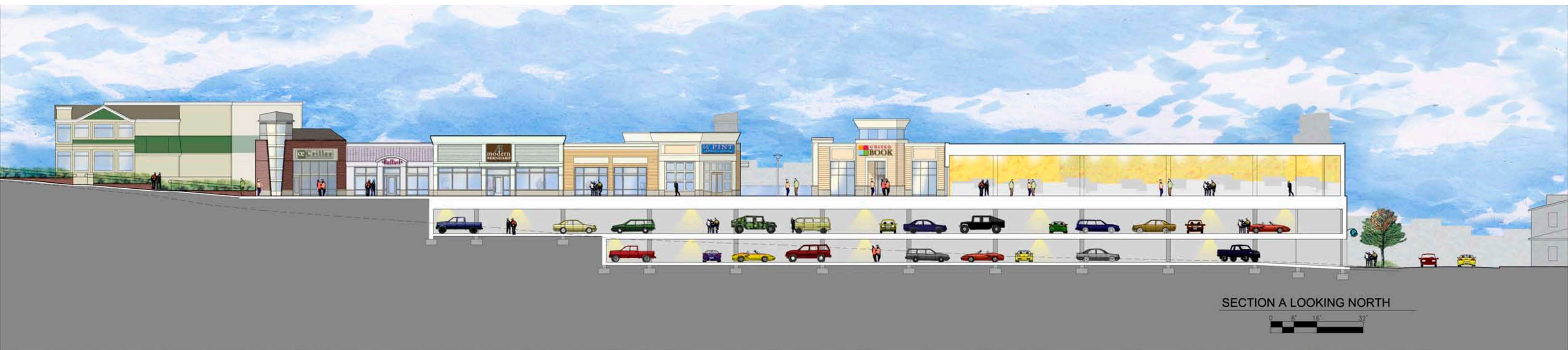
SECTION A LOOKING NORTH