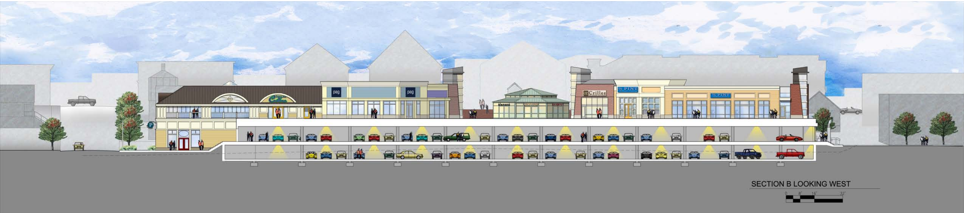
SECTION B LOOKING WEST